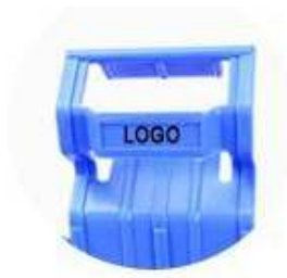
Emboss customized logo