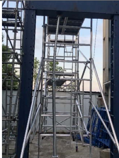
3 – After Test