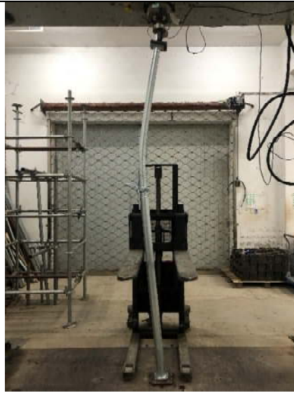
2 – After Test