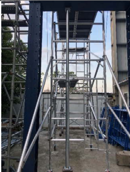
3 – In Test